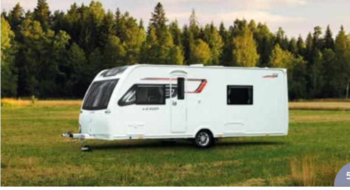
4 | Lexon 570 – shown in optional 'Aqua Clean' furnishings scheme