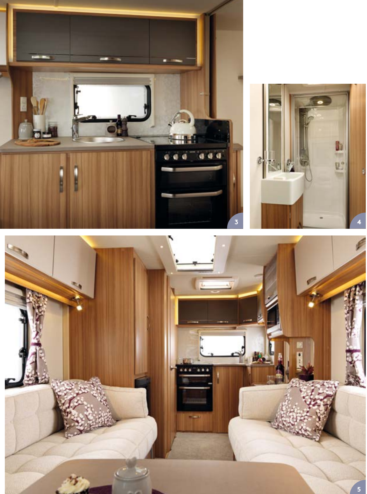
3 | New Thetford K series oven with 4 burner hob and surround locker lighting