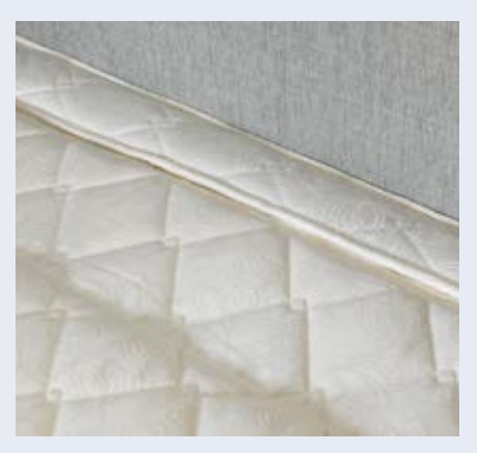
Optional mattress extension available for all transverse island beds