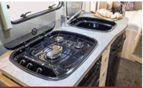
Kitchens are well-equipped with domestic-style appliances for a real home-from-home feel.