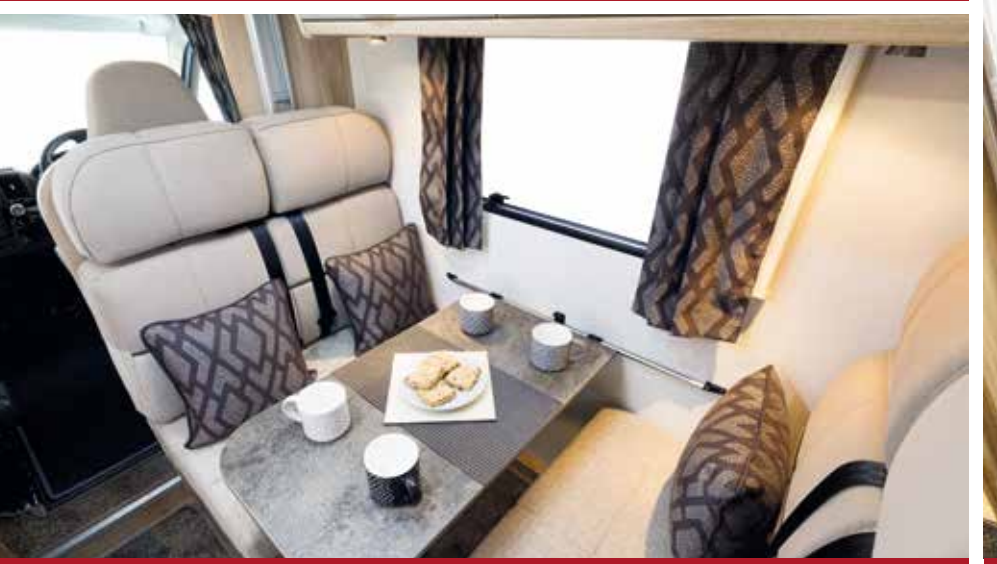
Elddis is the first and only motorhome manufacturer to provide a seat belt for every berth - including foldaway travel seats on all applicable layouts.