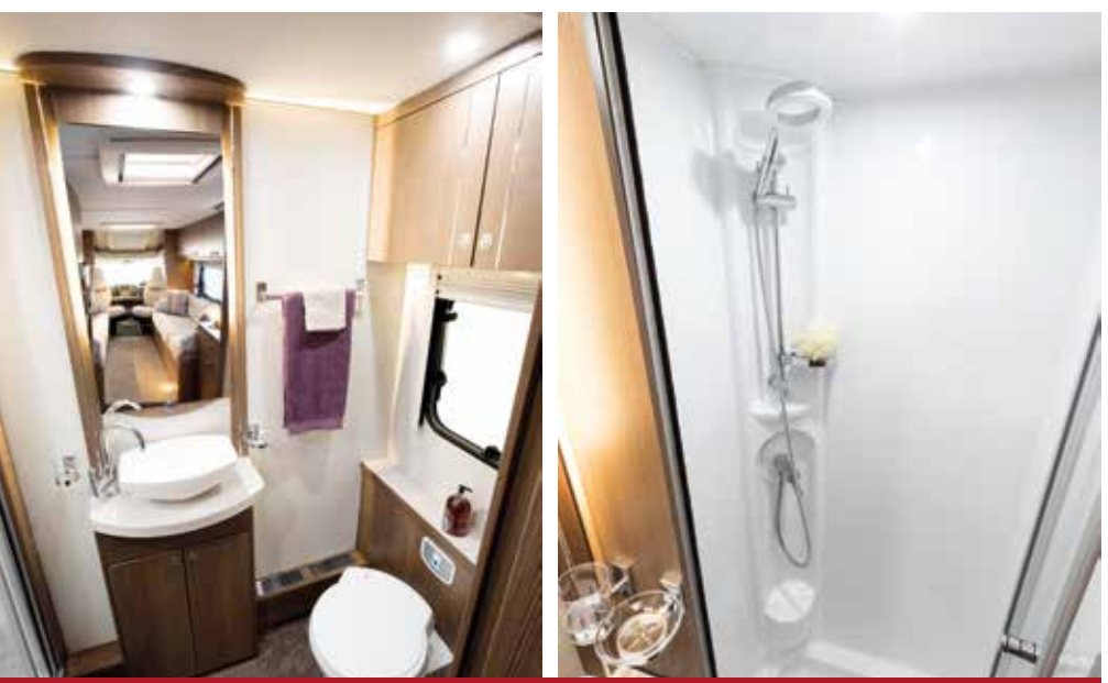
Elddis Encore motorhomes boast Alde 24hr programmable central heating for hot water on-demand. 100L water and waste tanks come as standard - and Ecocamel shower heads ensure your water goes further