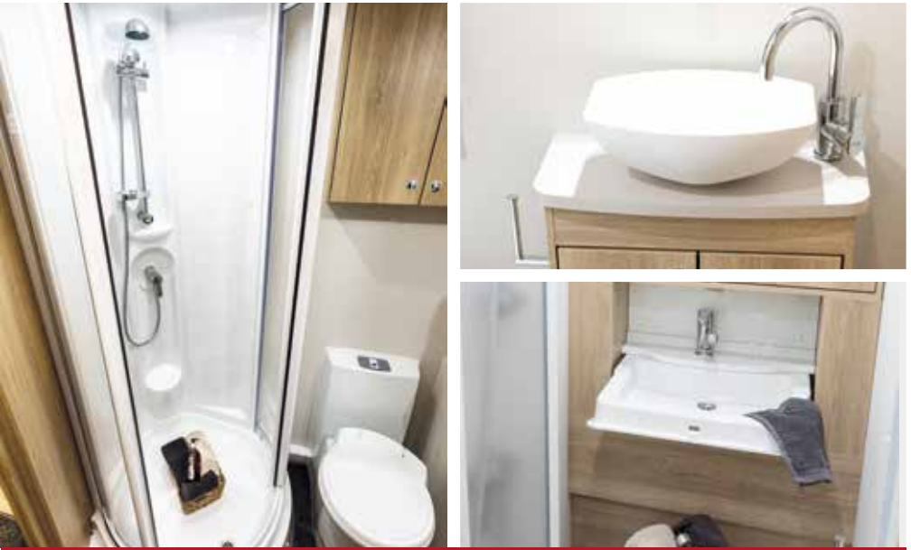
Elddis Autoquest models come with Whale Expanse dual-fuel underslung water heater, 4kW Whale Space heater and 100L fresh water tank* as standard.