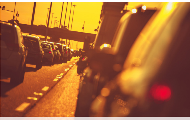
REAL TIME TRAFFIC UPDATES