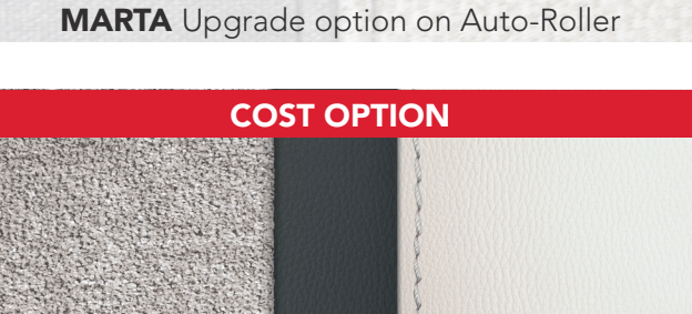
GINEVRA Upgrade option on Pegaso